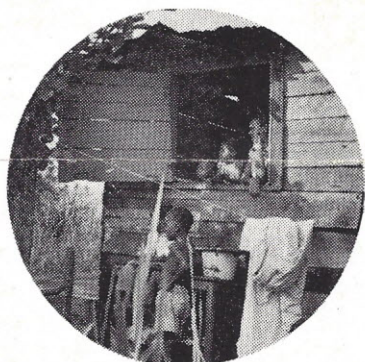
... still there are physical needs