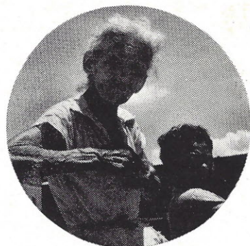
... the greatest need is Christ