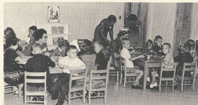
Learning by Sharing