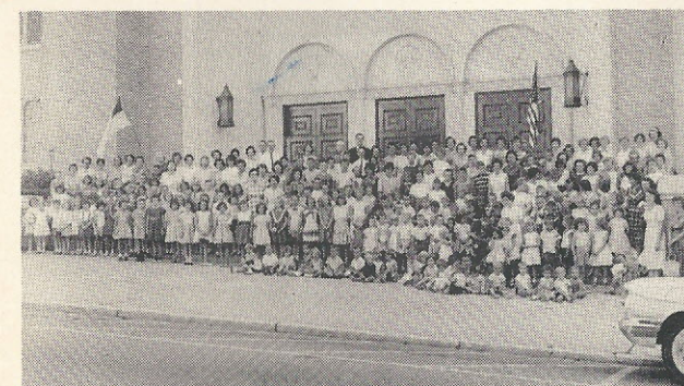
Vacation Bible School