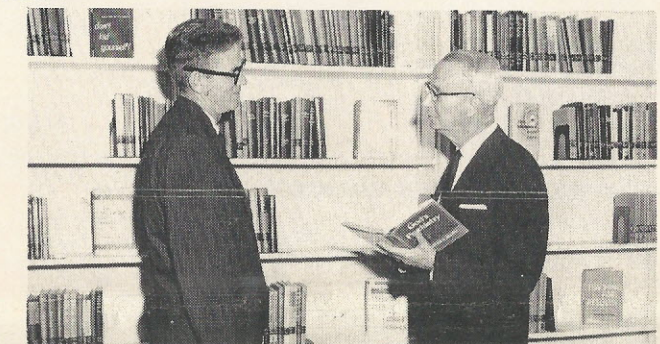
Books for All Ages