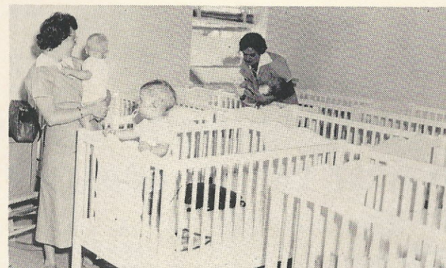
The Youngest Learn of God's Love