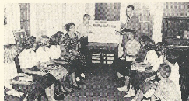
Learning by Doing