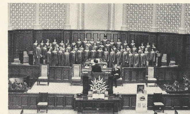
Choirs for 4 Years Thru Adults