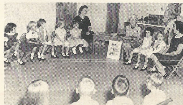
The Bible is Taught to All Ages