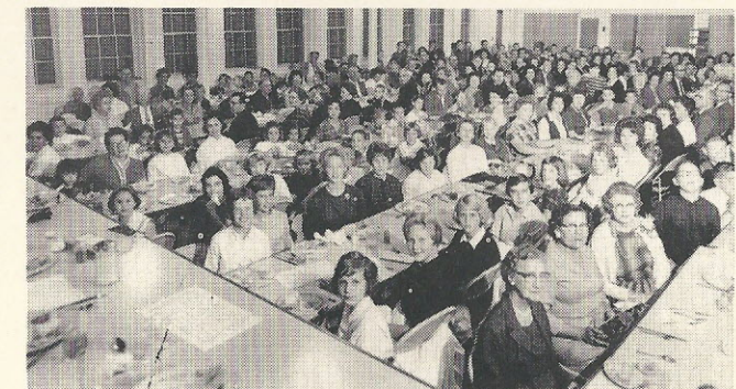
Fellowship Around the Tables Every Wednesday Night