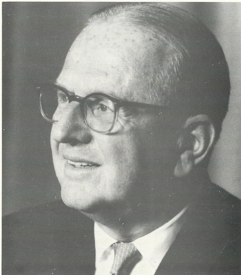
DR. NORMAN VINCENT PEALE Featured Speaker

GUIDEPOSTS CHURCH AWARD SERVICE MONDAY- JANUARY 19, 1970 7:30 P.M.