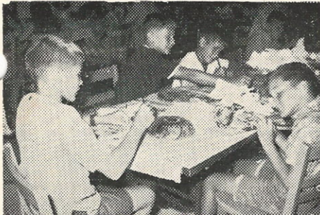
Juniors At Work