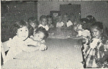
3 Year Olds