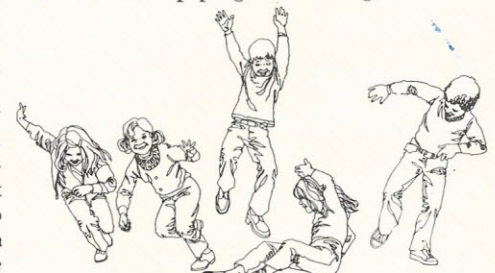
Children's Church Camp August 6-9