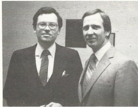
Revival Preacher and the Pastor