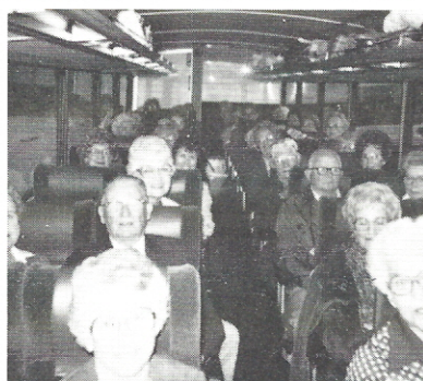
Same ole crowd!