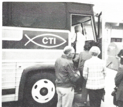
Brand new bus . . . . .