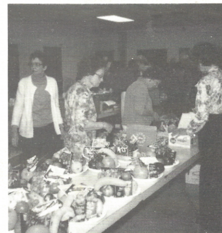
Pictured above are visitors for the Homebound Department preparing Christmas fruit plates for delivery to our homebound members.

We urgently need another counselor for 5th grade and two counselors for the 6th grade.