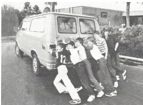
R.A.'s "push" their way to Lake Yale