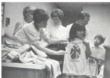
Receiving the Pastor's Pal T-shirt awards for completing the notebooks.