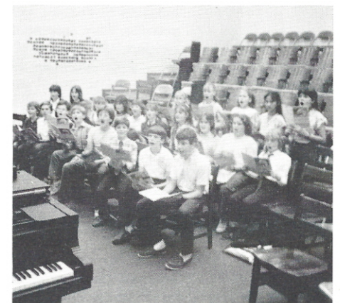
A recent rehearsal of the Middle School Choir, preparing for its special Christmas presentation, "A CELEBRATION OF JOY," which will include drama, on December 18, 6:15 P.M.