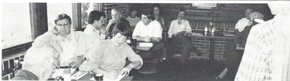
Christmas Pageant Committee chairmen in a recent meeting, pulling together the many details necessary to insure that everything goes according to plans for this year's pageant, December 11th and 12th.