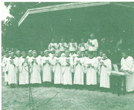
LEISURE TIMERS CHOIR

Channel 3 will air a special program Christmas Eve at 5:00 P.M. and Christmas Day at 1:30 P.M. Included in the program will be the two groups pictured above.