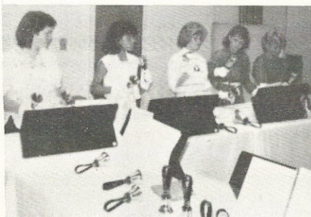
Middle School Handbell Ringers getting off to a great start. (See Music Ministry Article)

MALE CHORUS TO SING THIS SUNDAY NIGHT FOR THE EVENING WORSHIP SERVICE. ALL MEN OF THE CHURCH ARE INVITED TO SING. MEET IN THE CHOIR ROOM AT 5:45.