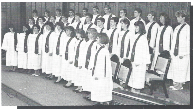
Chapel Choir on Departing Sunday

This Sunday Evening 7:15 P.M. during their HOME CONCERT