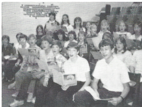
Middle School Choir preparing for Sunday, June 17th, concert at Wieuca Road Baptist Church, Atlanta, Georgia.

Call for more information: 438-6732 or 476-4255.