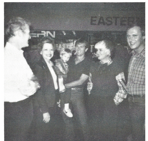
Partnership Evangelism Team pictured on the morning of departure.